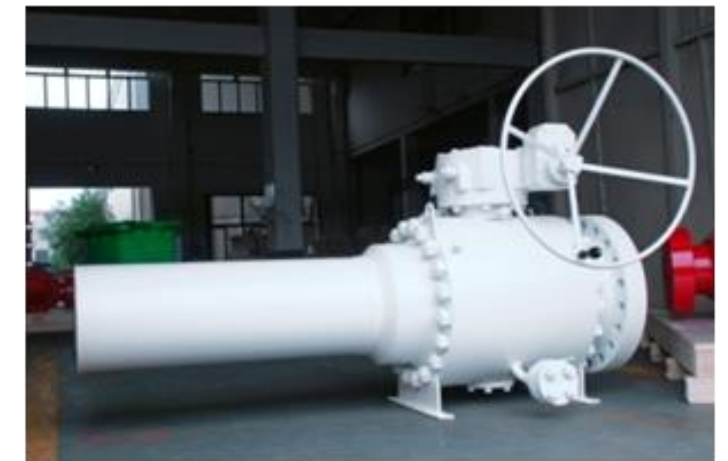
Trunnion Mounted Ball Valve For SANTOS Project