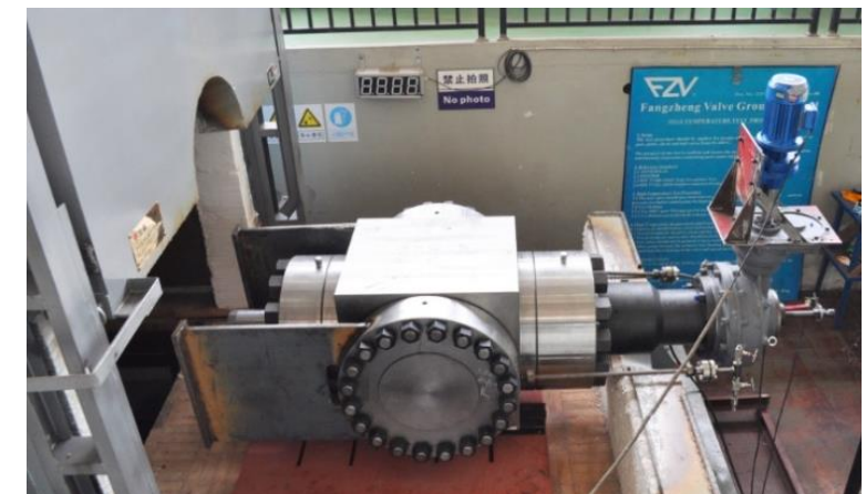
13-5/8", 20 tons and 10,000 PSI API6A Gate Valve For Project In Abu Dhabi