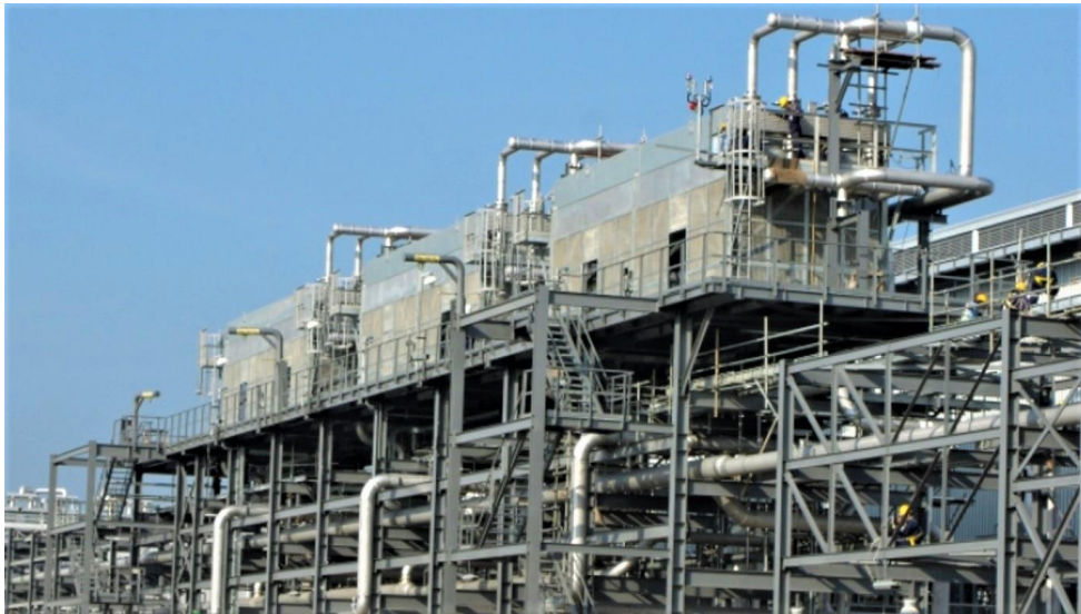
BCD-4 Betara Complex